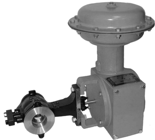
Mark V-100 Valve Body Shown

The typical actuator used is the pneumatic spring and diaphragm rotary actuator (1051). Mounting of this actuator can be on the right-hand or left-hand side viewed from the forward flow inlet.