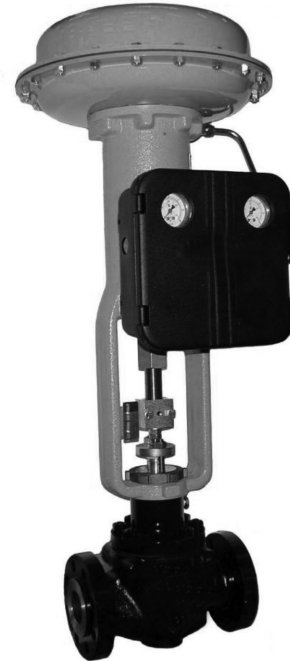
Mark EZ Valve